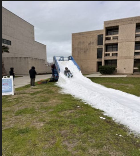
Winter Welcome Back Bash