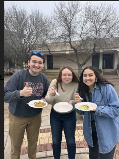
Green Dot - Green Pancakes